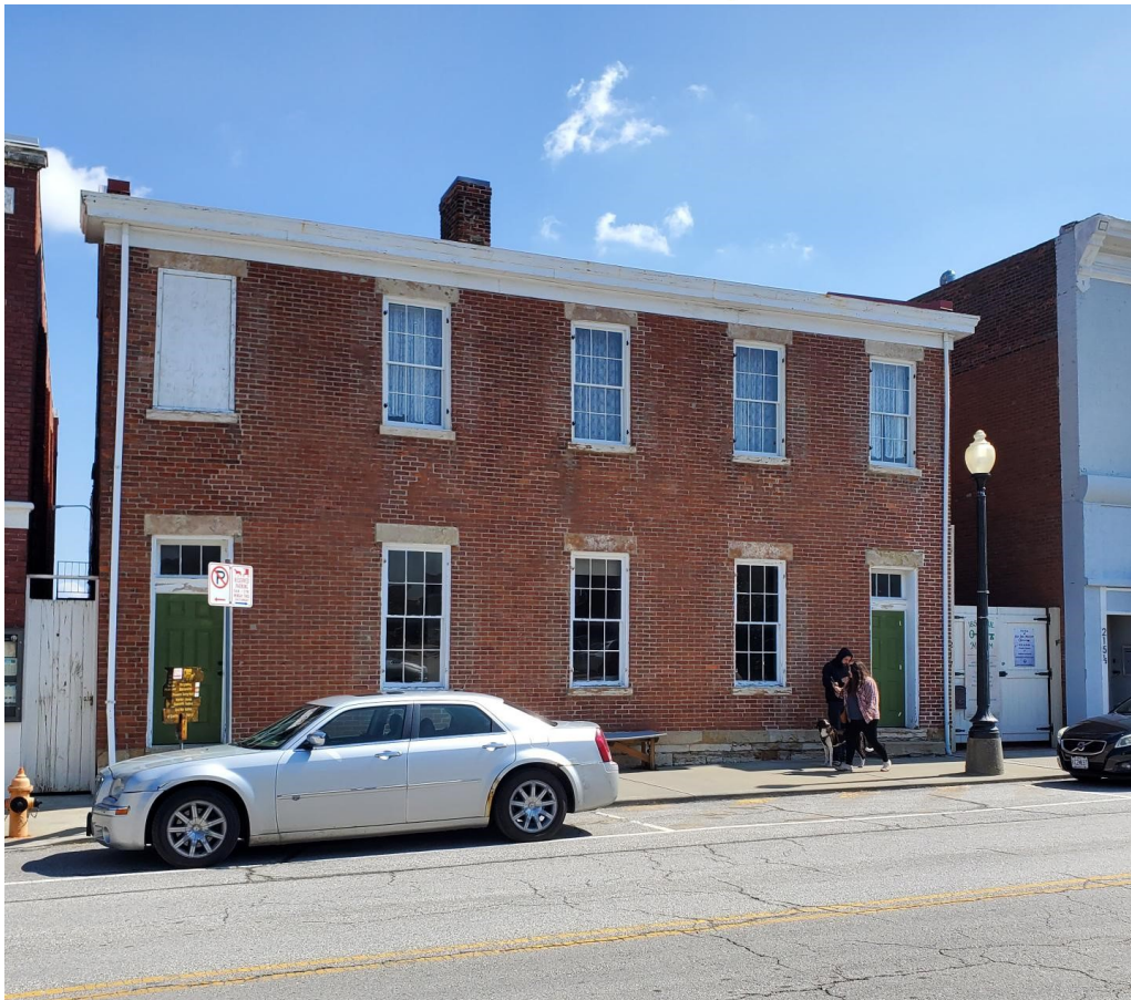
1859 Jail and Marshall House on the Independence Square