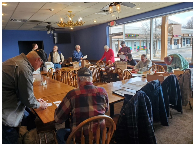
Production line for bag stuffing at Jumpin Catfish in Lee's summit on March 18.